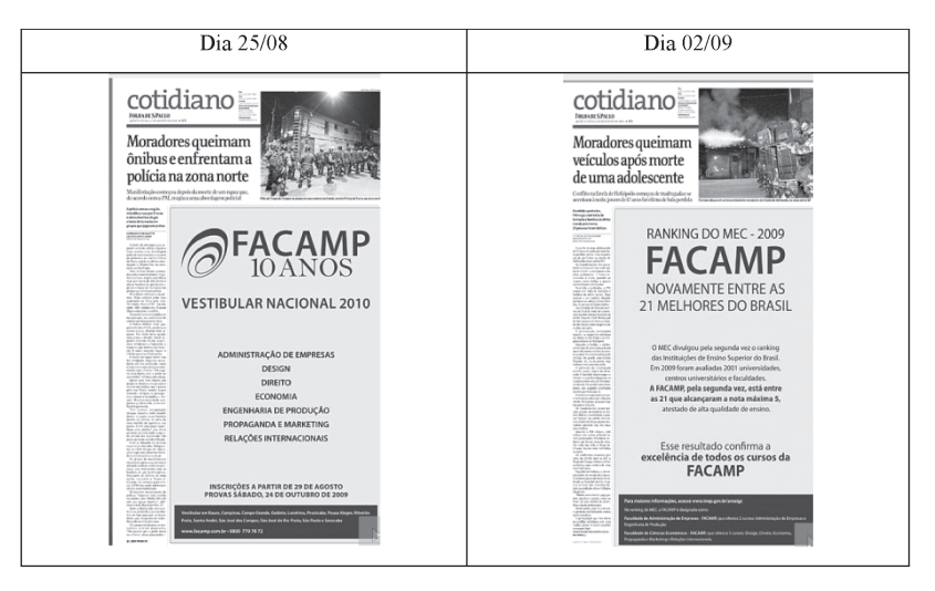
Picture 6 – Coverso f the 'Caderno Cotidiano', on the dates above mentioned

In the latter case, not only the product of Advertising piece is the same, as well as the text itself is repeated as it is started the same way: 'Residents burn...'. What does this instrumental cause in everyday reading of the newspaper? Or asking otherwise, what does the tactile reception provoke into the communicability process? Or, resuming Sodré, which effectively is not visible in mediatized communication process?