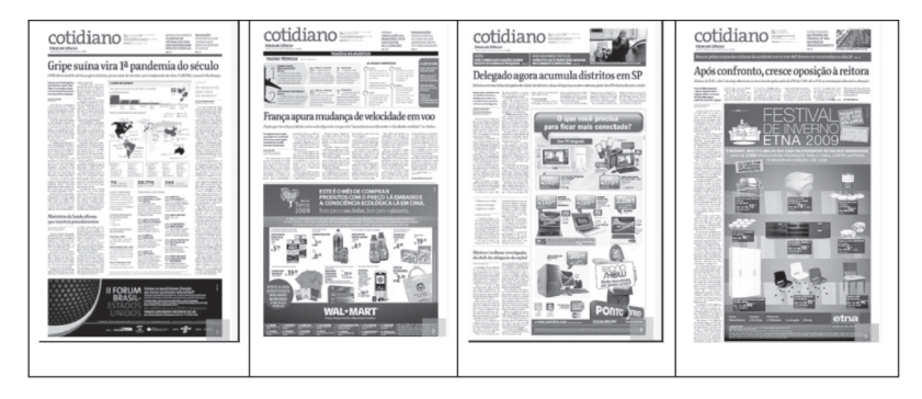
<u>Picture 2</u> – Covers of the 'Caderno Cotidiano' on the dates above mentioned

As it can be seen the SA abbreviation refers to a small Advertising piece occupying half of 1/3page; HP, the Advertising piece occupying 1/2 a page; FP is the piece that takes full page, portraying either a text column or just the headline of the article that will be discussed within the section. We also propose what we call "almost FP", as it uses two columns of text, with Advertising vertically, as shown above. Besides we have the WA, without Advertising piece, which prevailed in situations where the article was about some tragedy. During the research period there were two tragedies: the French plane that crashed in the Atlantic in June 2009 and the H1N1 flu. Observe, now, their constancy. The first