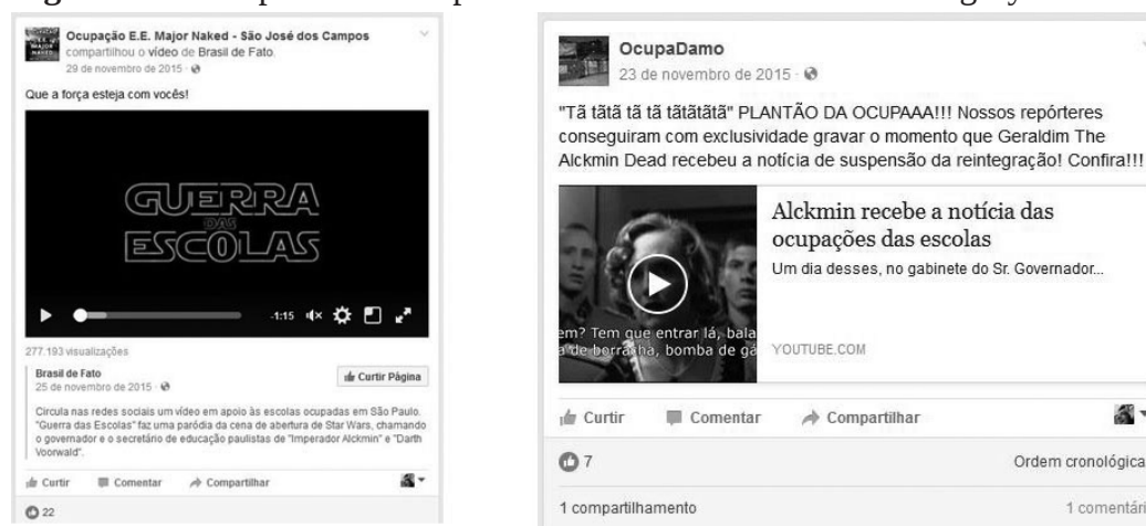
Figure 3 – Examples of video posts of the Media: student subcategory<sup>19</sup>