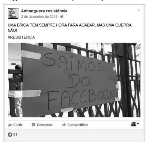
Figure 2 – Examples of posts of the Mobilization category<sup>17</sup>