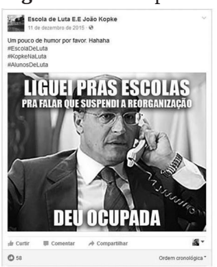
Figure 4 – Examples of meme posts of the Media : student subcategory<sup>22</sup>