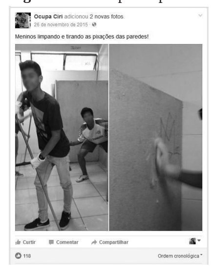
Figure 1 – Example of post of the Daily routine of occupation category<sup>16</sup>

The Mobilization category grouped posts aimed at encouraging engagement, adhesion, enthusiasm for the struggle and a sense of pride at participating. Thus, it is characterized by catchphrases – "Occupy, Resist and Evolve!!!" (Emydgio de Barros School, 11/26/2015), "An occupied school is an enchanted school!" (Caetano de Campos School – Consolação, 11/19/2015) – associated or not with photographs (in this case, as shown in Figure 2), and by calls to the movement's representative acts.