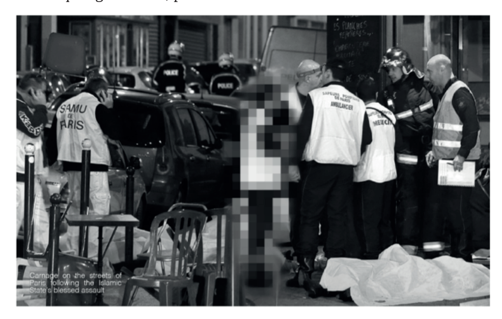
Figure 6 – Dabiq Magazine #12, p. 28

Figure 6 is captioned as follows: "Carnage on the streets of Paris following the Islamic State's blessed assault". Like the other figures analysed earlier, we can observe elements of concern and/or a sense of urgency that reaffirm the terrorist attacks impacts. We also remark there is one person is blurred. Once again, it is a woman and this procedure was made for the same reason as in Figure 1.