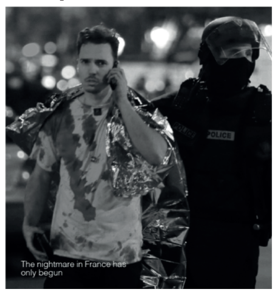
Figure 4 – Dabiq Magazine #12, p. 2