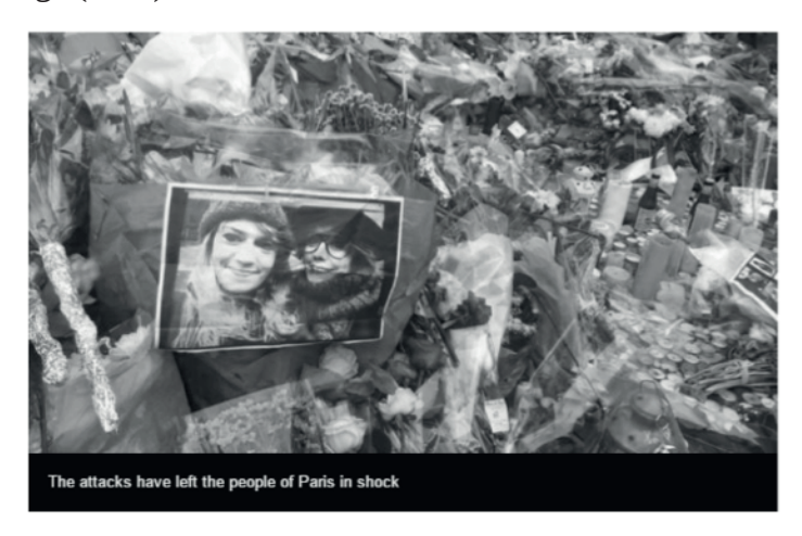
Figure 14 – Burridge (2015)