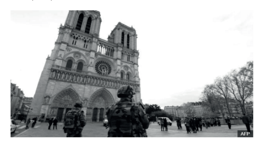
Figure 10 – Peter (2015)