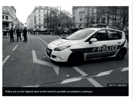
Figure 11 – Peter (2015)

In this news report we can see three figures. The first one is a map showing where the attacks took place. The second figure shows a police car and a caution tape and is captioned as follows: "Police are on the highest alert as the hunt for possible accomplices continues". In such a way, the message this passage shares is that the police is on the streets working to protect the citizens of Paris.