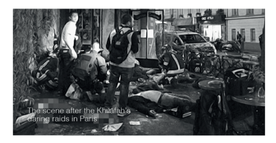
Figure 3 – Dabiq Magazine #12, p. 2

reflector is used to highlight the face of a frightened young man. This way, a dramatic scene is captured. Like Figure 1, Figure 3 concentrates on bloody bodies, firefighters and frightened faces, and once again Dabiq tries to imply the idea of a successful action driven by the Islamic State.