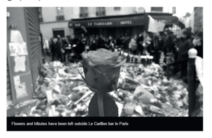
Figure 13 – Burridge (2015)