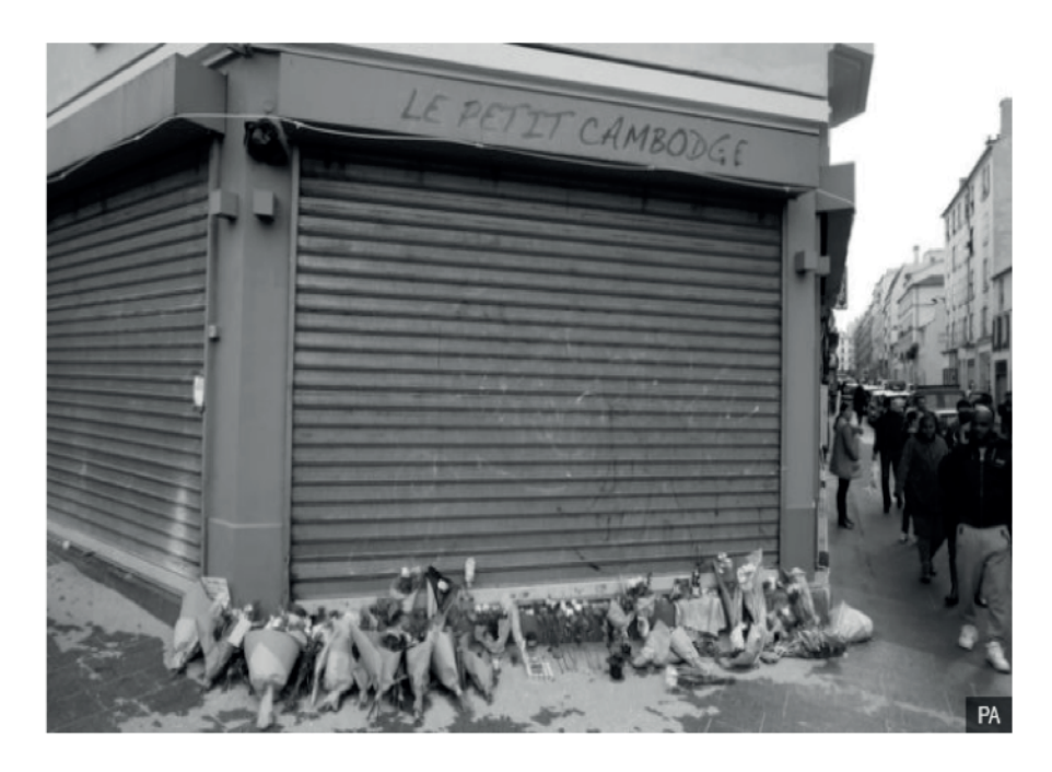
Figure 9 – Schofield (2015)