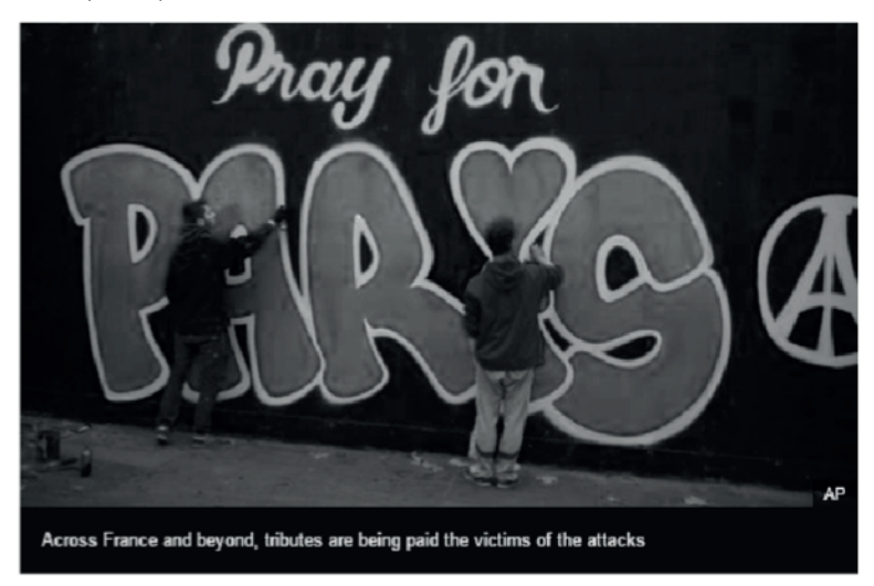
Figure 8 – Gardner (2015)