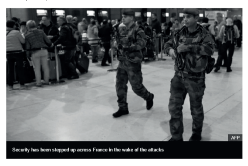
Figure 7 – Gardner (2015)

The news report we are analysing shows three figures; however, only two of them address the Paris attacks. Figure 7 has the following caption: "Security has been stepped up across France in the wake of the attacks". It is a figure that associates the heavily armed military personnel at an airport with the process of entering the country. Hence, there is a clear reference to conflicts over the refugee influx. Figure 8 is captioned as follows: "Across France and beyond, tributes are being paid the victims of the attacks". It also shows two young men graffiti on one wall: "Pray for Paris". This figure was extensively shared through the social media and became widely known.