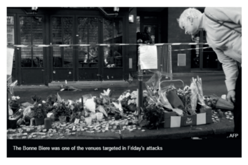
Figure 12 – Burridge (2015)

The news report "Paris attacks: Grief, anger and defiance on city streets", released on November 18, 2015, deals especially with the testimonies given by victims' relatives and survivors. Burridge's (2015) news report has figures that reinforces the solidarity that has spread all over Paris. In Figure 12 caption we can read: "The Bonne Biere was one of the venues targeted in Friday's attacks". Although the location is different, the flowers left there share the same intentions and messages. We can also notice that in this figure there is a French citizen reading the honours given by many other people. At the same time, this person is, herself, honouring the victims.