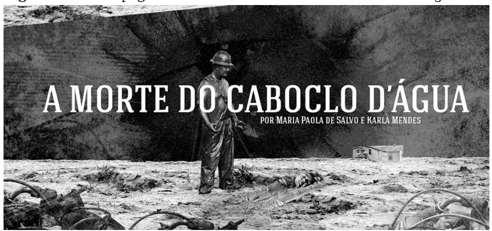
Figure 1 – Initial page of the news article A morte do caboclo d'água