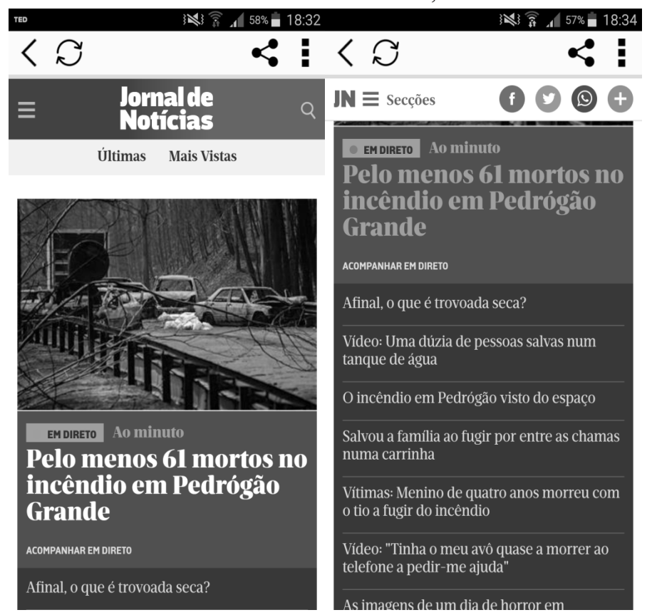
Figure 1 - Screenshots of the JN Mobile Web of June 18, 2017

During Sunday, June 18, JN updated its readers about the uncontrolled flames, balances of the number of victims and survivors, fire brigade mobilizations and rescue teams, witness reports and official reactions. Updates came in as breaking news notifications, direct flashes from reporters on the field, and continuous updating of the homepages of the website and mobile Web as well as the JN application. The digital platforms kept a deep red background as a warning sign under the "Fires" label.